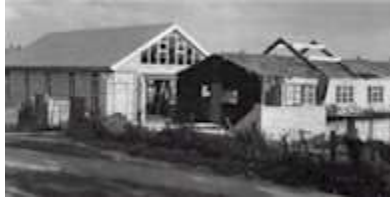
Building over the Wooden shed in the late 60's with our brick building MKI!

Our first building was built in the late 1920's and was a wooden shed on signal road.